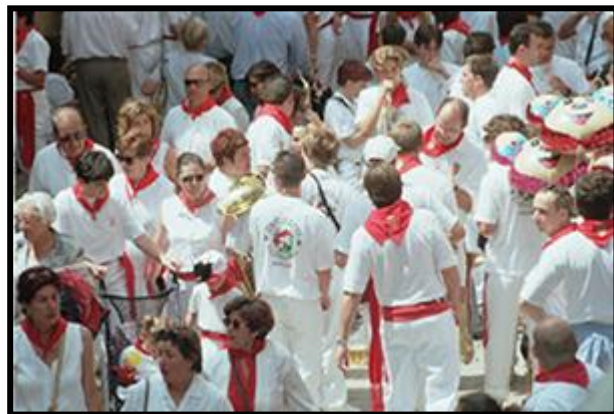
La estatua de San Fermín